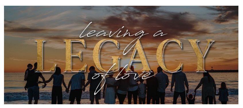
The Promises of a Fresh Start January 21 & 22, 2023